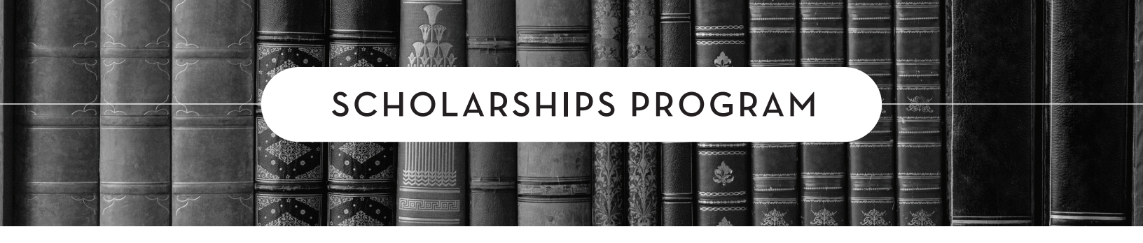
Student Participation • Recipient Recognition • Community Awareness • Increasing the Fund

Each of our scholarships encourage patriotism, assist students in attaining an education and help students reach their full potential. This increases VFW and Auxiliary recognition while supporting our communities, students and members.