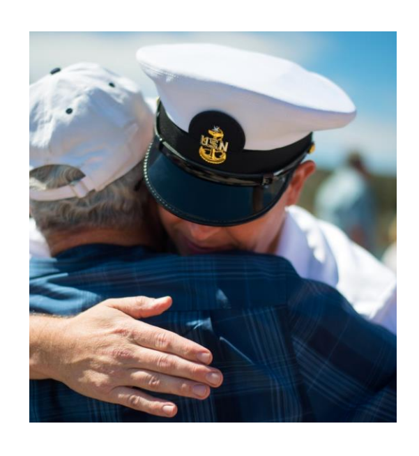
Veterans & Military Support Programs