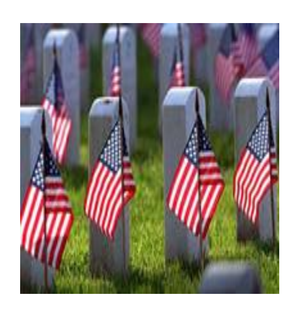
NVS Suicide Prevention